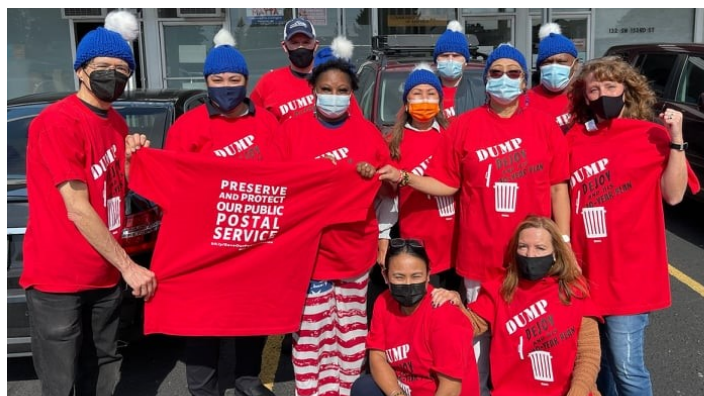
Seattle APWU Executive Board sporting “Dump DeJoy and His Ten-Year Plan” (front); “Preserve and Protect Our Public Postal Service” (back) t-shirts. Order (minimum 24, specify size) from Sawicki & Sons, (313)962-2725